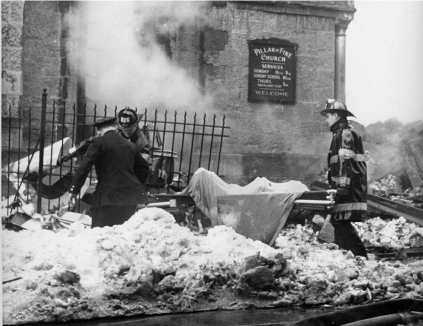
Bodies being carried beyond the Pillar of Fire Church